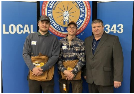
Limited Energy Graduates