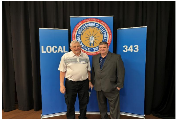
55-Year Award Recipient