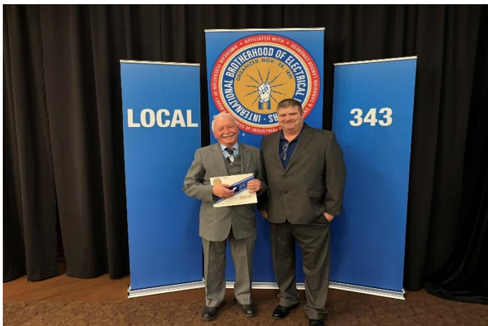
60-Year Award Recipient