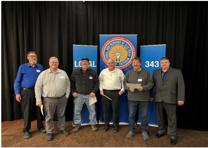
40-Year Award Recipients