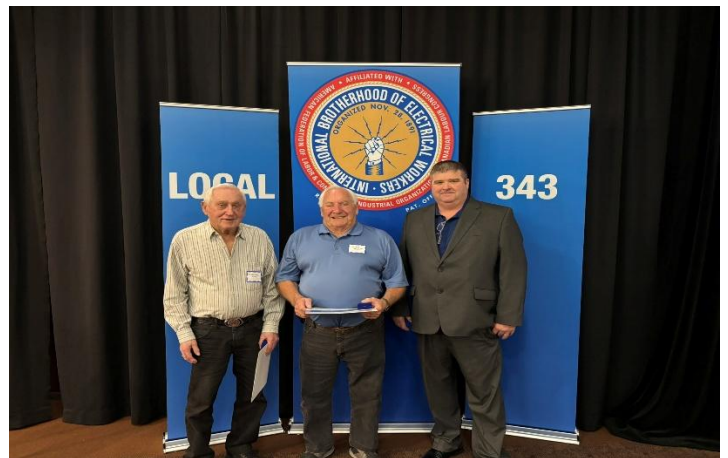
65-Year Award Recipients