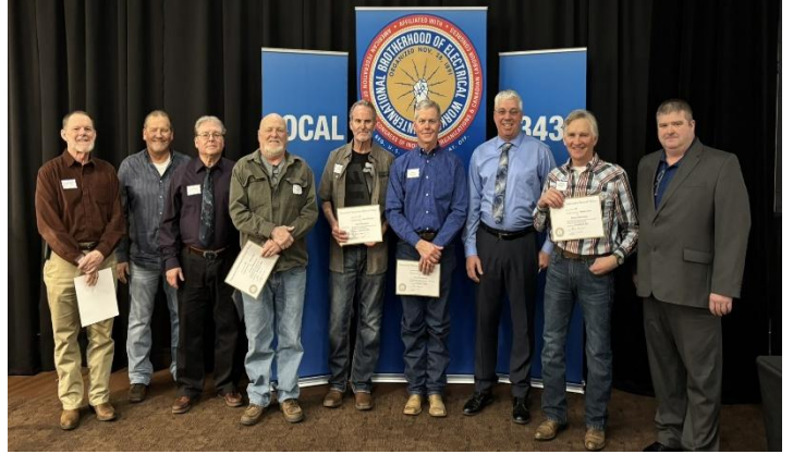
35-Year Award Recipients